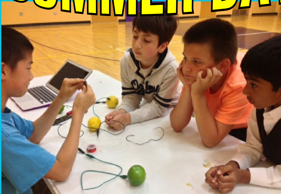
SCIENCE & MATH LABS